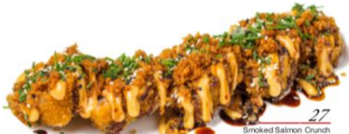
27 Smoked Salmon Crunch