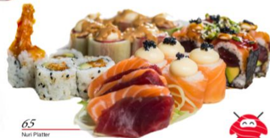
65 Nuri Platter