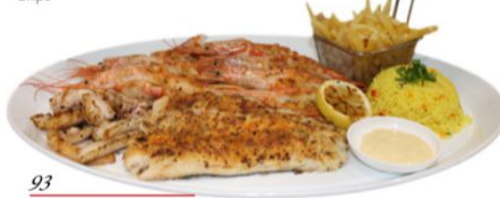
93 Platter for One

95. FAMILY PLATTER R450.00 12 Queen Prawns, Calamari Tubes, Calamari Heads, Calamari Strips, 4 Hake Fillets Fried or Grilled with Tartar Sauce & Savoury Rice & Chips