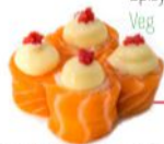
13 Salmon Roses