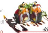
46 Rainbow Reloaded