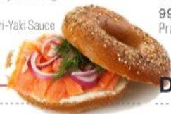
82 California Bagel

84. HOT PHILADELPHIA R58.00 Smoked Salmon, spicy cream cheese, avocado