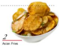
2 Asian Fries