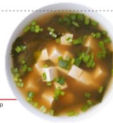
98 Tofu Miso Soup

99. TOM YUM SOUP R49.00 Prawn, Hot & Spicy