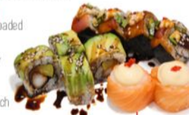
58 Rays Deluxe Combo