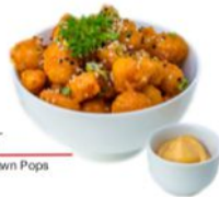
6 Prawn Pops