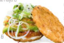
28 Salmon Crunch Burger