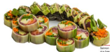
69 Salmon & Tuna cucumber rice free rolls